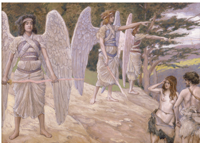
Expulsion from Paradise James Tissot

A number of clues in the book of Genesis reveal that God created the garden of Eden as a pre-temple sanctuary for his presence. The garden and the tabernacle/temple share a similar physical arrangement. In Genesis, God planted the garden "toward the east, in Eden" (Genesis 2:8+ NASV). Later we read that God stationed cherubim at "the east of the garden of Eden" to prevent anyone from returning west to the Tree of Life (Genesis 3:24+). In the book of Numbers, this east-west orientation is the basis for the tribal arrangement for Moses, Aaron, and his sons who perform the service of the tabernacle (Numbers 3:38+).